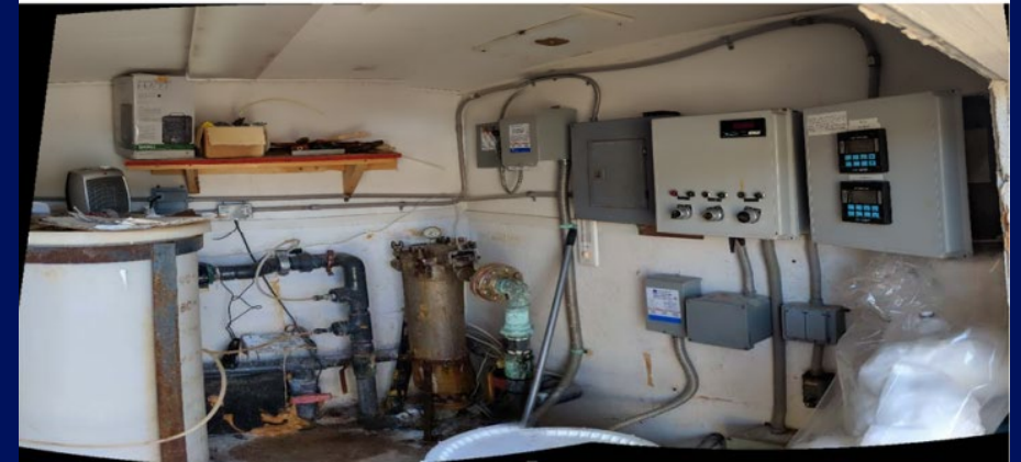
Figure 5: Control Building B Interior