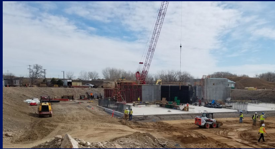
Box Elder Sanitation District Wastewater Treatment Plant Upgrades Project